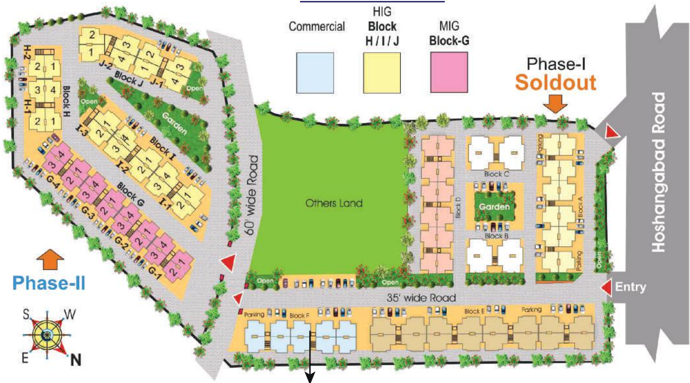
Block F COMMERCIAL BLOCK